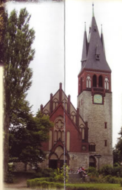
The Genezareth Church, built in 1896/97

WATERSPORTS - Erkner, surrounded by water, is a tourist centre for many kinds of water sports. You can obtain boats from the many hire firms in the area, including kayaks, motorboats and canoes. Whether you choose a canoe or a paddle boat, you will be enthralled by the relaxing experience. When, after a