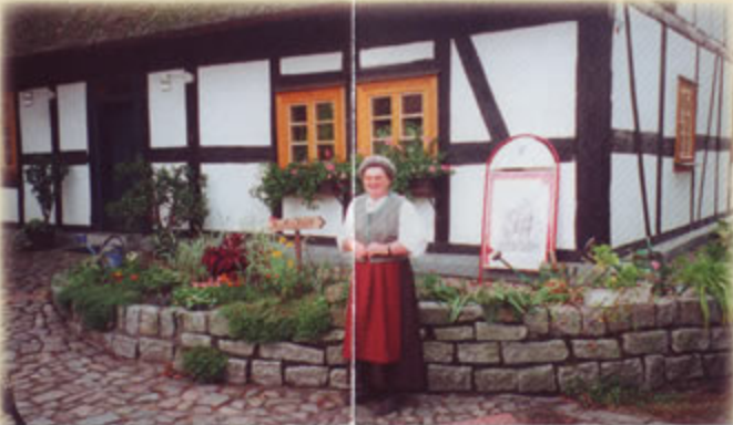
"Mutter Wolfen" from Gerhart Hauptmann's novel "Biberpelz" in front of the Heimatmuseum (local history museum) - Erkner's oldest building

ERKNER was first mentioned in the year 1579 in the record of births found in the church in Rüdersdorf. The earliest inhabitants were fishermen and their families. The coming of the railway in 1842 saw the development of Erkner together with the beginnings of industry, leading to further industrialisation at the beginning of 20th century. Until that time Erkner was a centre for Berliners to make short trips to benefit from the healthy atmosphere found here. This atmosphere inspired the famous German author, Gerhart Hauptmann, to move where he spent four years of his life. He felt at one with the 'märkische' landscape and built a relationship with the local people, learning about their life and customs. The many things he learned this way inspired much of his work. For example, his book "Biberpelz" features all the people he had known well in Erkner.