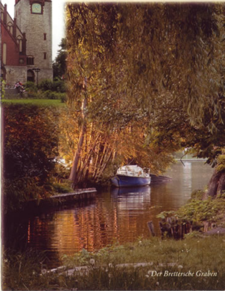
Der Brettersche Graben

CYCLING - In the 'Grünheider Wald- und Seengebiet' are well-planned cycling routes which give both relaxing and challenging experiences. You may wish to explore further along the routes and visit other areas or simply spend a day. Don't forget your swimsuit and your picnic basket.